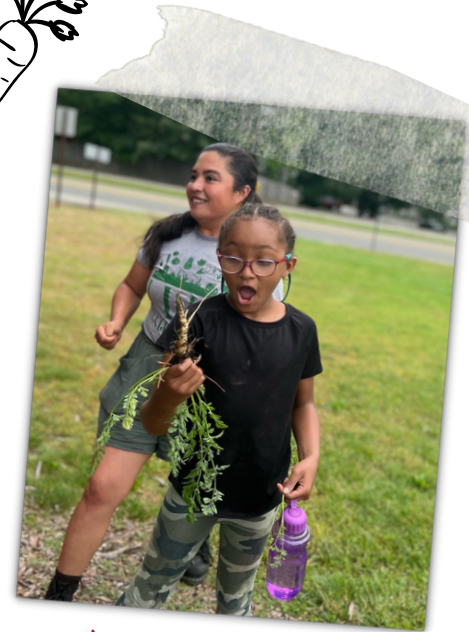
garden club @ 3 pm